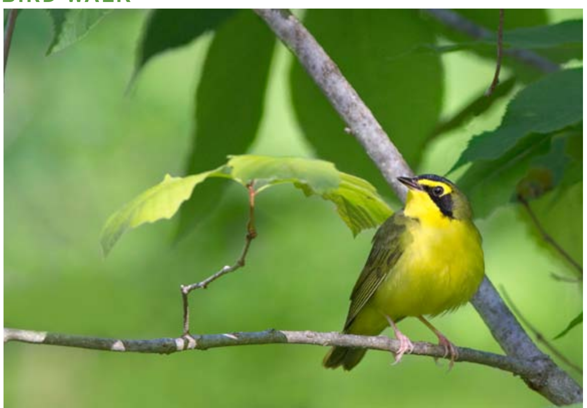
Kentucky Warbler in Butternut Bottom

Bird Walk: Saturday, April 28, at 7 a.m.