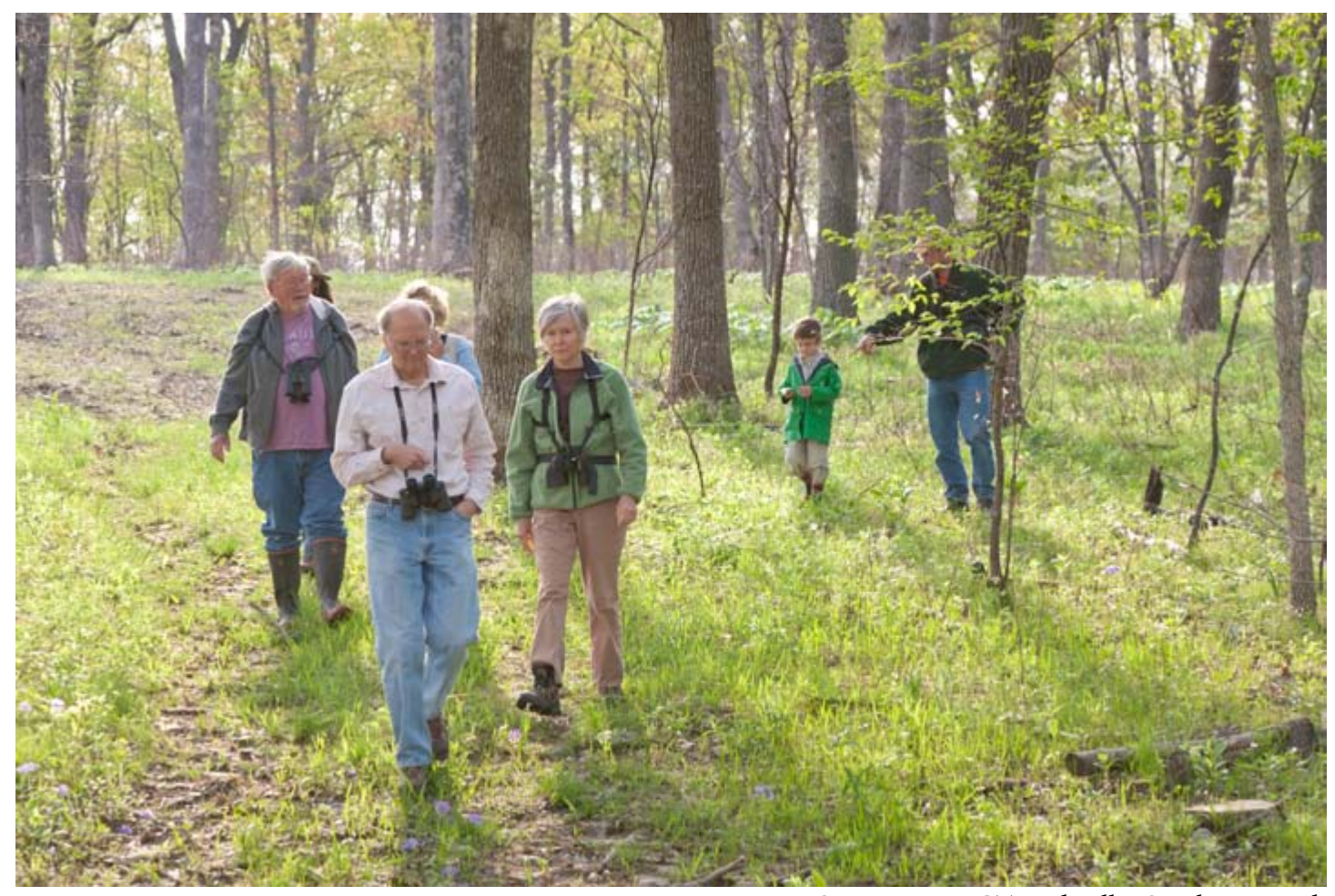
Spring 2011 PGT Birdwalk - South 40 Woods

Get inspired by experiencing the beauty of nature on one of our nature walks!