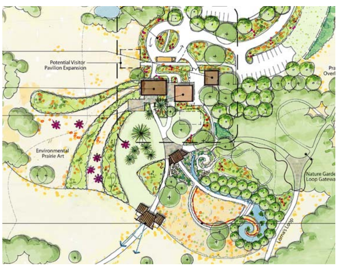
Proposed Gardens around the PGT Visitor Center

Drawings of the plans are displayed on the walls of the PGT Visitor Center. Check them out the next time you stop by for a visit.