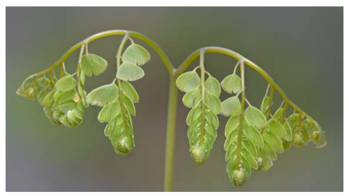
Maidenhair Fern emerges on a north-facing slope