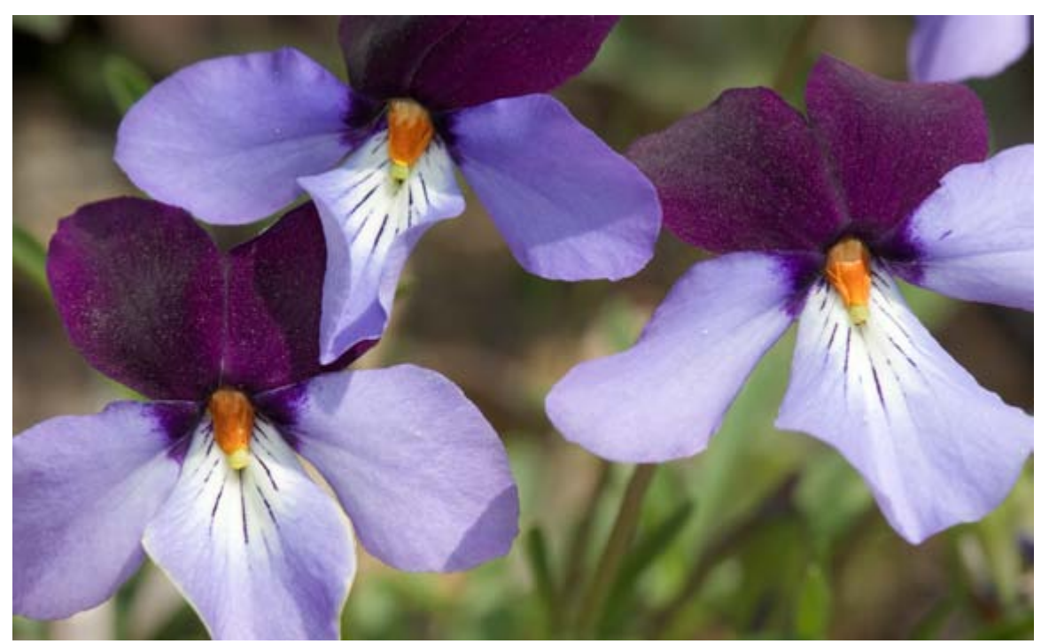
Bird's Foot Violet along the ridge trail to The Point

Wildflower Walk: Saturday, May 12, 9 a.m.